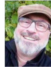
Senator for culture and education in the Hanseatic City of Lübeck. Patroness of the Intercultural Summer 2022